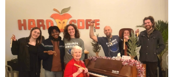
Winners of "Wichita's Got Talent" fundraiser!