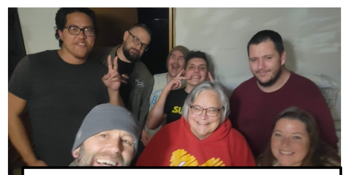
We love our AWESOME DINNER Volunteers!