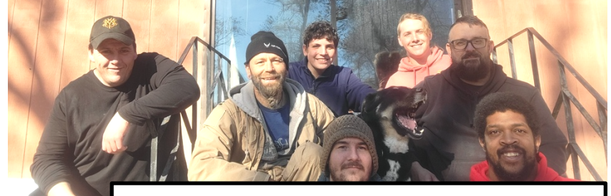
Workday @ Gma's House & Puppy Keno's Grin!