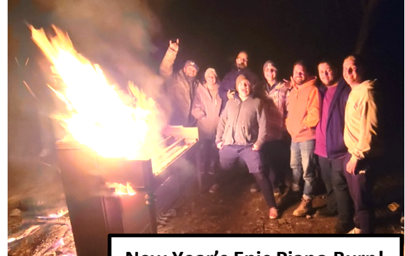
New Year's Epic Piano Burn!