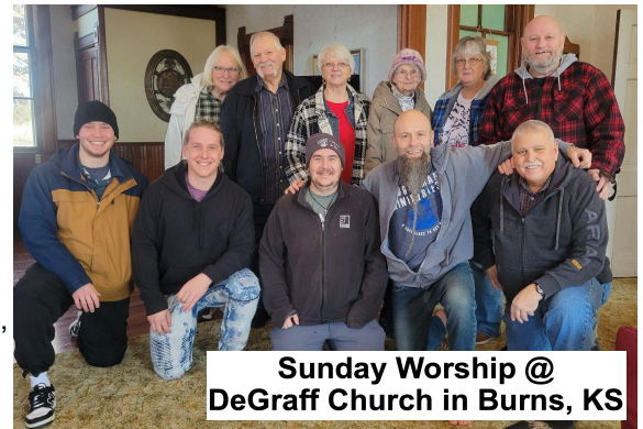
Sunday Worship @ DeGraff Church in Burns, KS

Concert! Free event! Great food & Live music from area musical groups who are friends of Beggarman Ministries! Including, among others, Friends University Singing Quakers this year!