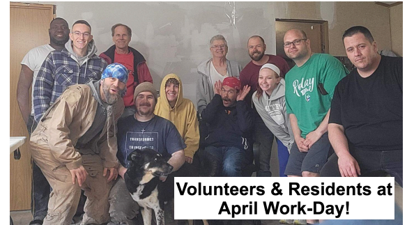
Volunteers & Residents at April Work-Day!

As we honor the Risen Lord who gives us our HOPE, may you be blessed this season in your journey!