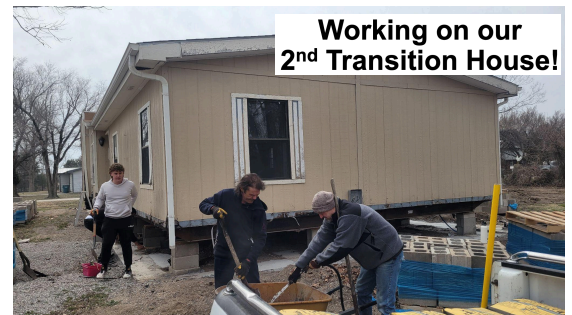
Working on our 2nd Transition House!

In March 2025, our first house we affectionately call “Grandma’s House” welcomed our 28th resident and filled our last empty bed. We are seeing the gift and effectiveness of our program as well as the need growing as the word spreads. Hopefully as we move through 2025 we will be able to open our 2nd house to accommodate 8 more men!